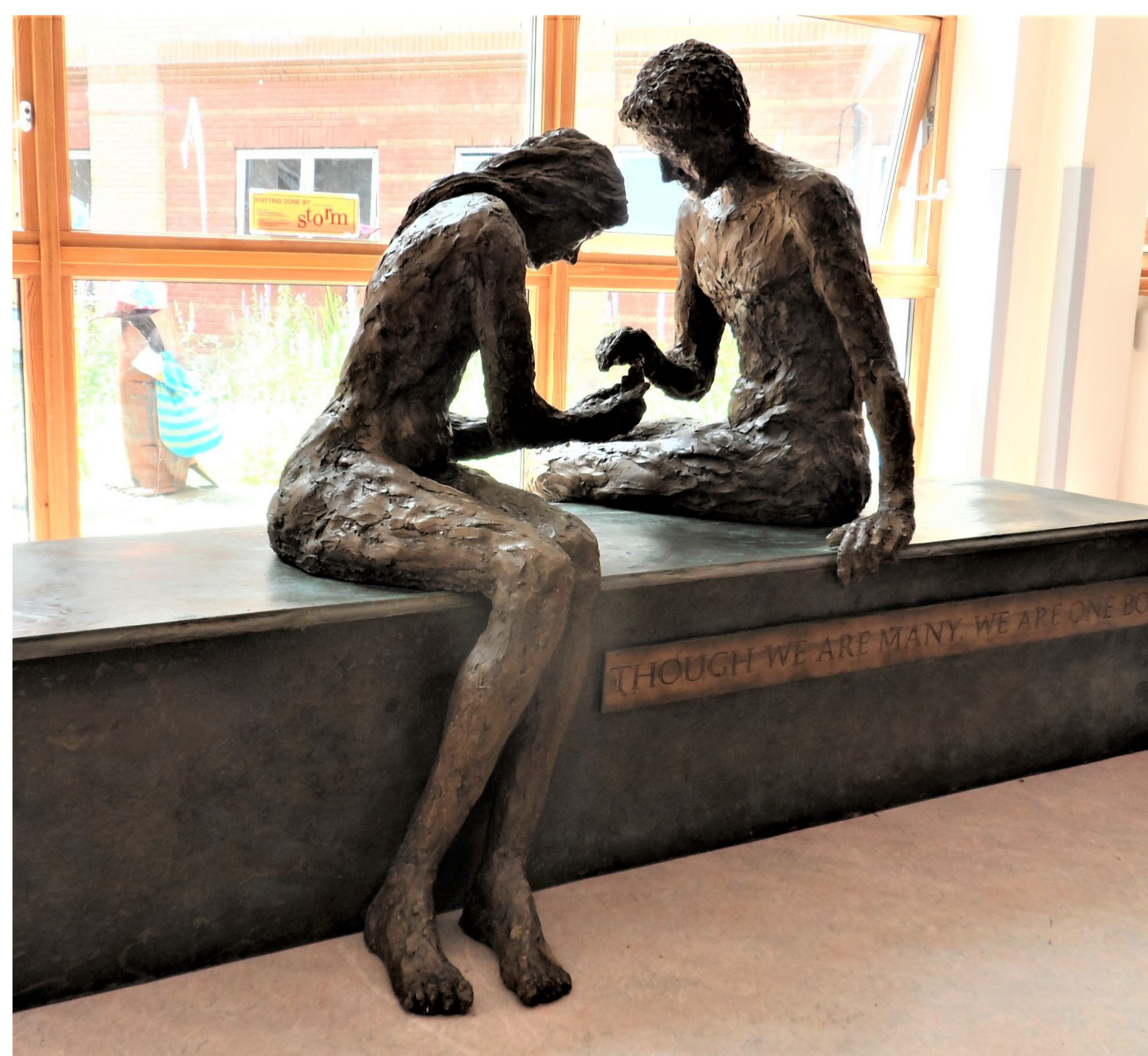
The Gift - a celebration of organ donation Chichester and Worthing Hospitals