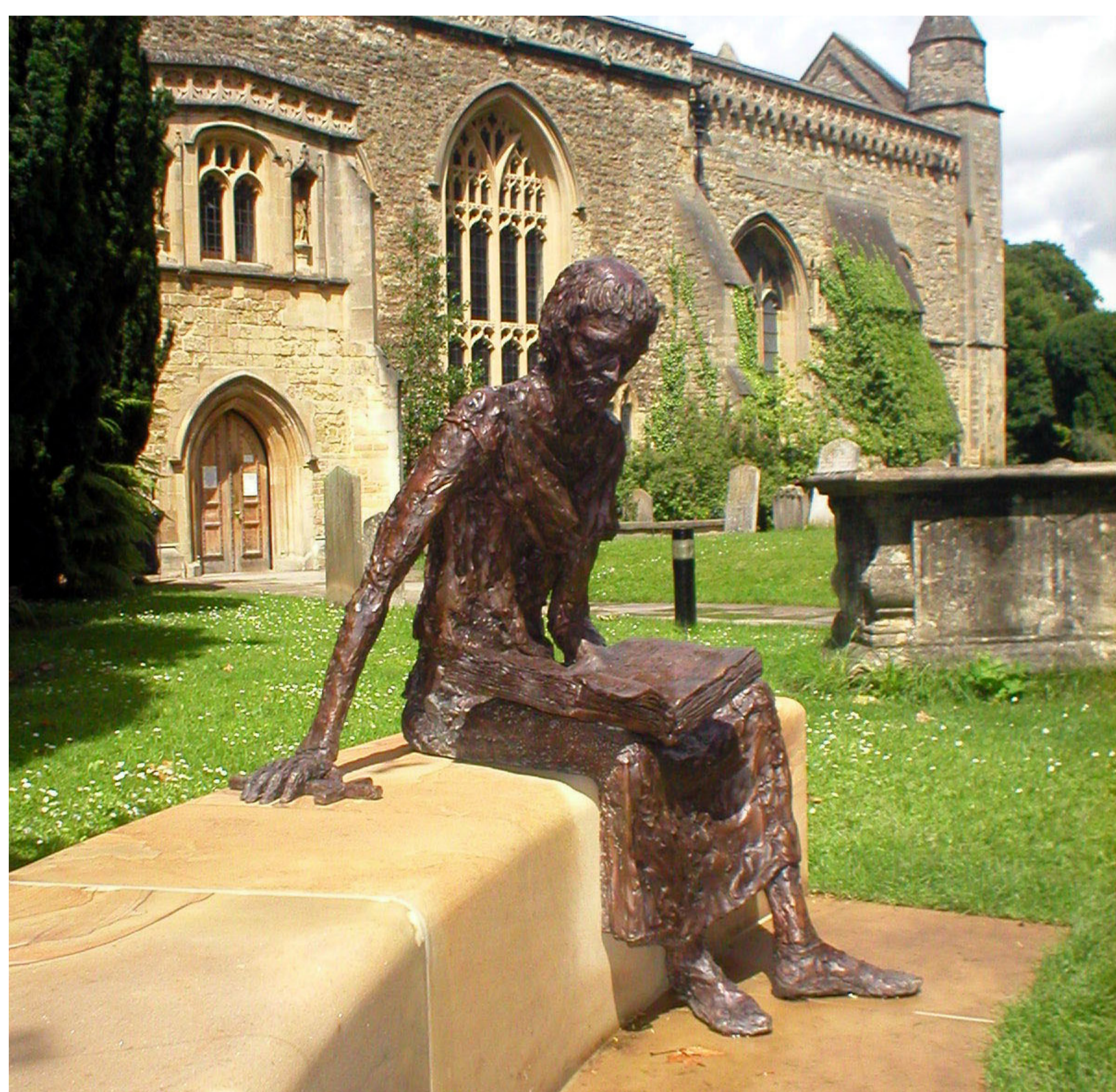
St. Edmund of Abingdon Oxford and Cambridge Universities

Most of my work is to commission, public or private, and I value the artist / client relationship, because the challenge of other people's ideas is a way of progressing one's own thoughts. In recent years, where I have had the good fortune to gain an increasing number of public commissions, my respect for the process has increased. I have had to relate to and interact with not just individual but community involvement, and I have become convinced that the most valuable art is a joint creation of the artist and the society in which and for which he or she works.